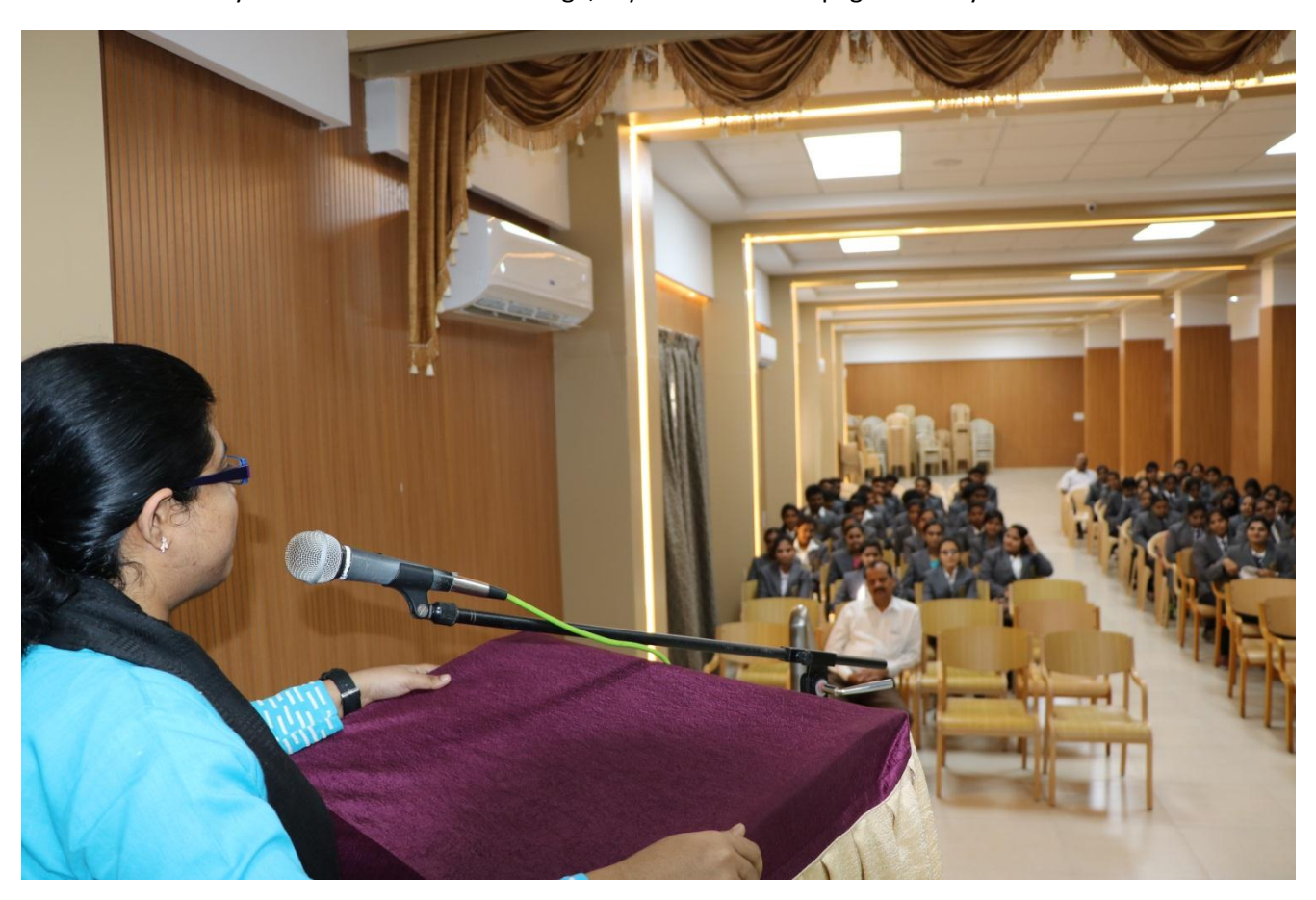
Vidyavardhaka First Grade College, Mysuru –Activities page for the year 2017-18